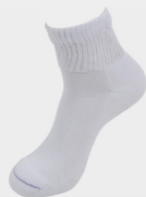
CREW SOCKS IN BLACK, WHITE OR NAVY ONLY