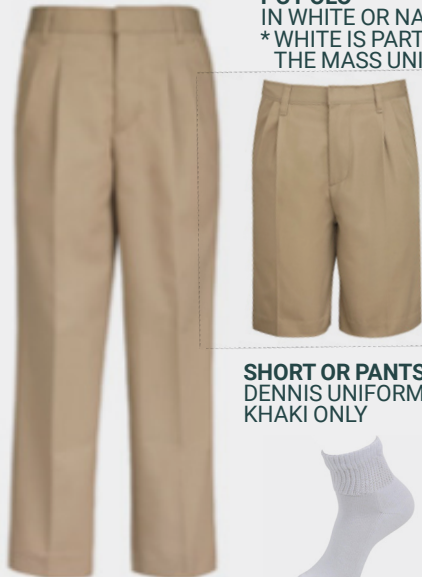
SHORT OR PANTS DENNIS UNIFORM KHAKI ONLY