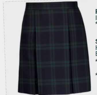
SKIRT HOP-STITCHED OR BOX-PLEAT SKIRT * WORN NO SHORTER THAN 2" ABOVE THE KNEE * PART OF THE MASS UNIFORM