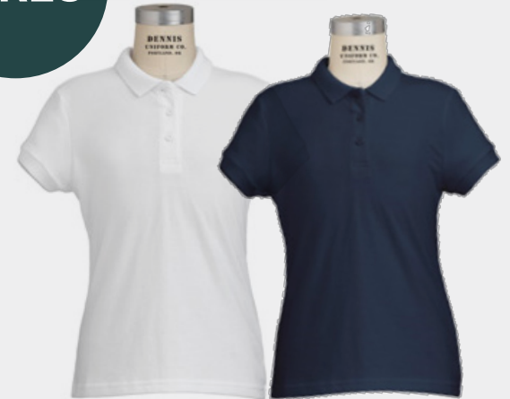
PC POLO IN WHITE OR NAVY * WHITE IS PART OF THE MASS UNIFORM