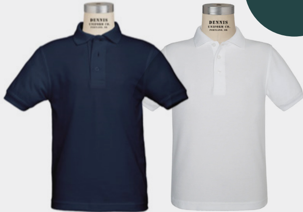
PC POLO IN WHITE OR NAVY * WHITE IS PART OF THE MASS UNIFORM