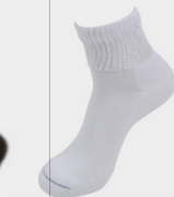
CREW, KNEE HIGH OR TIGHTS IN BLACK, WHITE OR NAVY ONLY